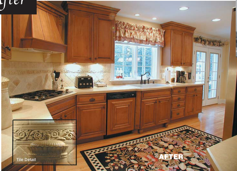
AFTER PHOTOS BY JULES CONSTANTINE